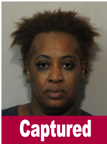
Photograph taken in 2015