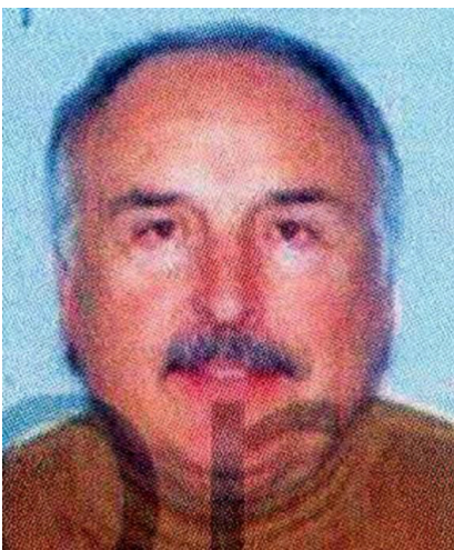
Photograph taken in 2010