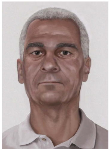
Age Progressed Photograph