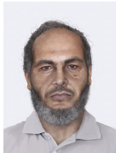
Age Progressed Photograph