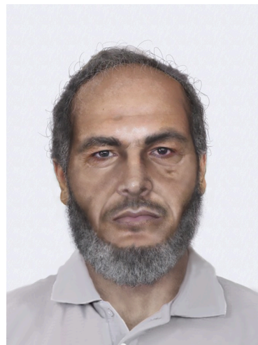
Age Progressed Photograph