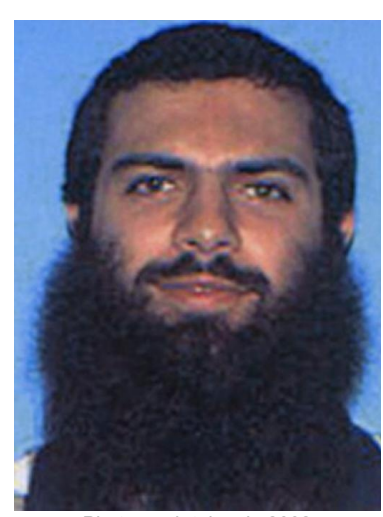
Photograph taken in 2002