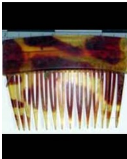
Victim's Hair Comb

Found on 04/18/1985 in Clay County, Missouri