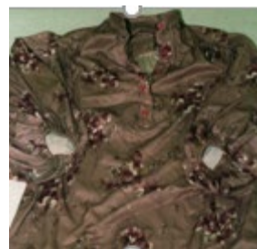
Blouse with floral pattern. (There is also a skirt made from the same material).