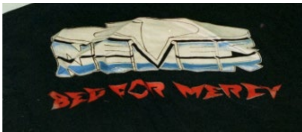
Writing on black t-shirt.

The below pictured clothing/belongings were recovered during a search of a serial offender's tractor trailer cab (additional items were recovered that are not pictured). The offender has been linked to multiple homicide/missing person cases from the late 1970s to the early 1990s. As a long-haul truck driver, the offender has been through over 30 states at various times. Therefore, investigators are asking the public to review the items and notify authorities if they recognize any.