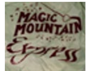
Writing on the back of light-colored nylon jacket.