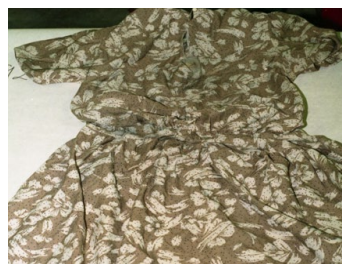
Dress with floral pattern.