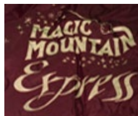
Writing on the back of maroon nylon jacket.