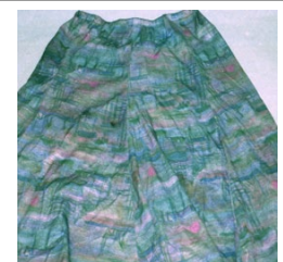
Skirt with rainbow pattern.