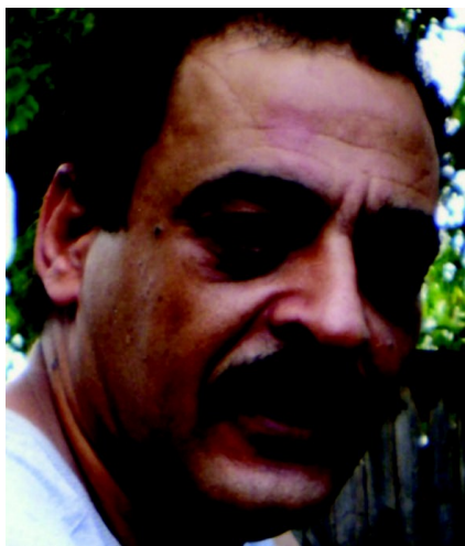
Photograph taken in 2007