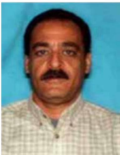
Photograph taken in 2006

Unlawful Flight to Avoid Prosecution - Capital Murder - Multiple