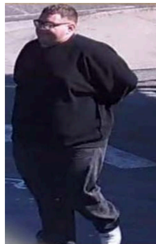
Photograph taken in 2019