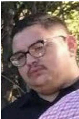
Photograph taken in 2018