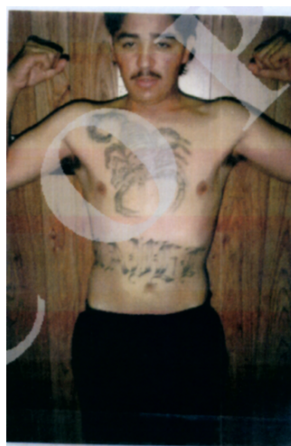
Photograph taken in 1992