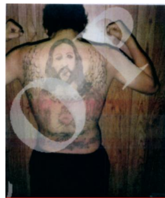
Photograph taken in 1992