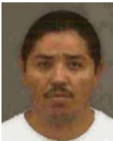
Photograph taken in 1998

Conspiracy to Conduct the Affairs of an Enterprise, Through a Pattern of Racketeering Activity; Conspiracy to Distribute and Possess with the Intent to Distribute Controlled Substances; Conspiracy to Import Controlled Substances; Conspiracy to Launder Monetary Instruments; Conspiracy to Kill Persons in a Foreign Country; Murder Resulting from the Use and Carrying of a Firearm During and in Relation to Crimes of Violence and Drug Trafficking; Murder in Aid of Racketeering Activity