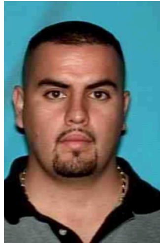
Photograph taken in 2006