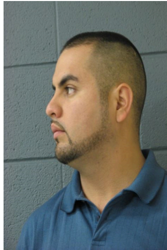
Photograph taken in 2011