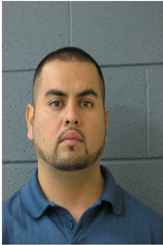
Photograph taken in 2011

Unlawful Flight to Avoid Prosecution - First Degree Murder