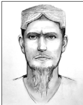
Unknown Individual 1