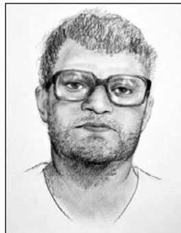
Unknown Individual 4