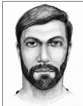
Unknown Individual 2