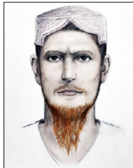
Unknown Individual 1