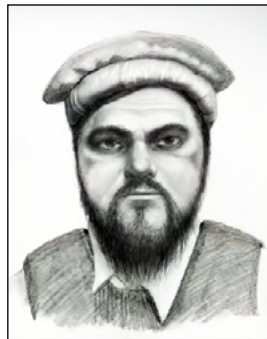
Unknown Individual 3