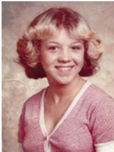
Photograph taken circa 1978

Murder Victim Caledonia, New York November 10, 1979