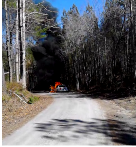
Robinson's vehicle, discovered engulfed in flames on March 10, 2013