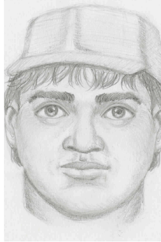
Composite sketch of suspect 2