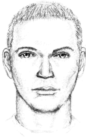
Composite sketch of suspect 1