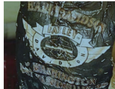
Harley Davidson T-shirt