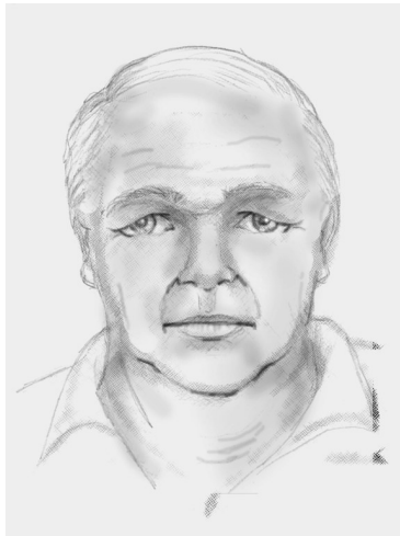
Sketch Aged Enhanced in 2013