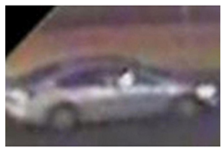
Surveillance photo of suspects' vehicle