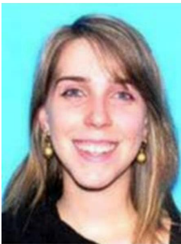
Photograph taken in 2007