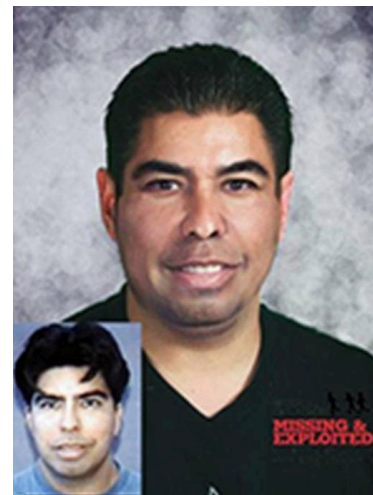
Photograph age progressed to 46 years of age