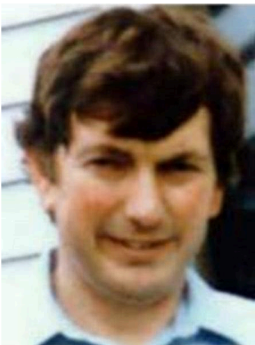
Photograph taken between 1984 and 1986

Unlawful Flight to Avoid Prosecution - Parental Kidnapping; Harboring