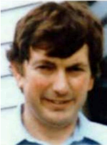
Photograph taken between 1984 and 1986

Unlawful Flight to Avoid Prosecution - Parental Kidnapping; Harboring