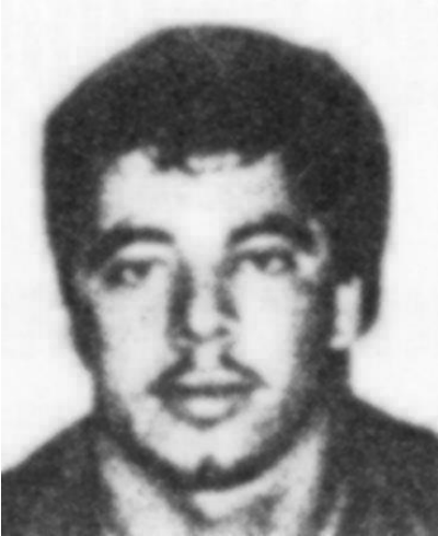
Photograph taken in 1986

Unlawful Flight to Avoid Prosecution - Murder, Fourth Degree Unlawful Possession of a Weapon, Third Degree Possession of a Weapon for an Unlawful Purpose, Third Degree Hindering Apprehension