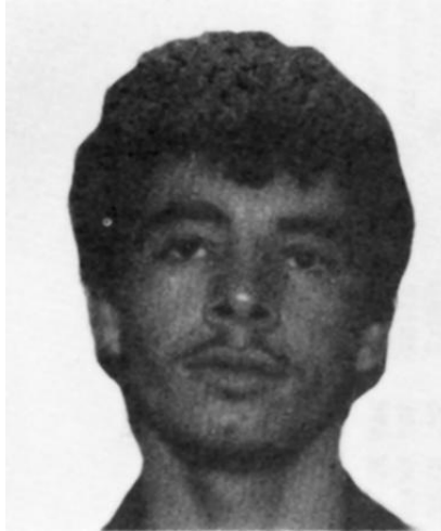
Photograph taken in 1984