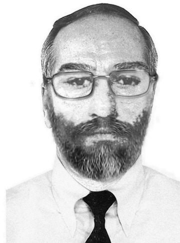
Drawing enhanced, age progressed to 52 years old