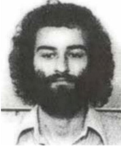
Photograph taken in 1983

Unlawful Flight to Avoid Prosecution - First Degree Murder