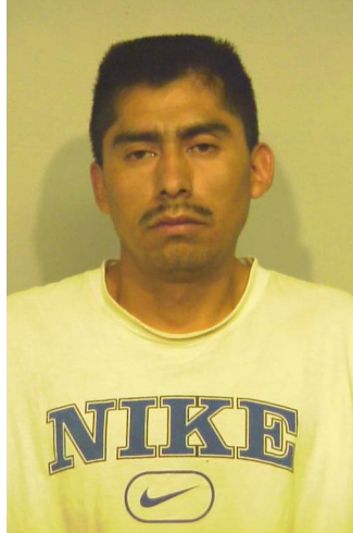
Photograph taken in 2009