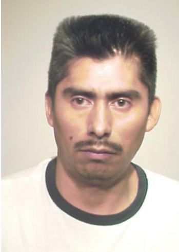
Photograph taken in 2008

Unlawful Flight to Avoid Prosecution - Aggravated Driving Under the Influence (DUI)/Death