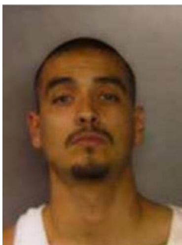
Photograph taken in April of 2007

Unlawful Flight to Avoid Prosecution - Homicide