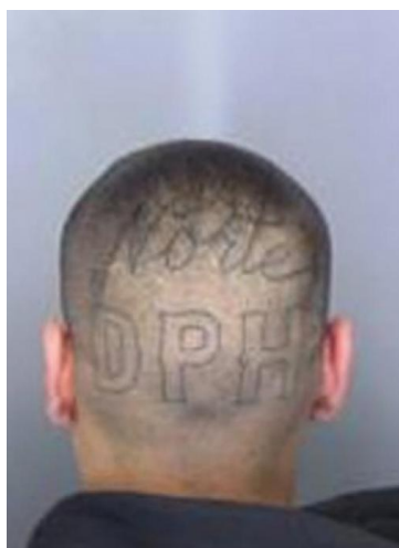
Tattoos on back of head