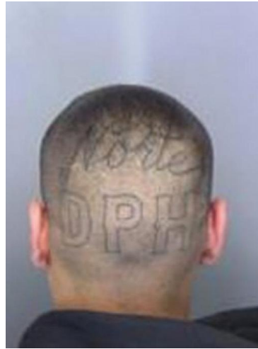
Tattoos on back of head