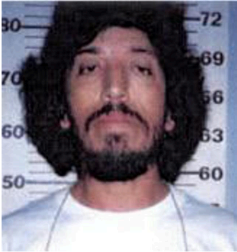
Photograph taken around 1992

Unlawful Flight to Avoid Prosecution - Murder