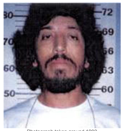
Photograph taken around 1992