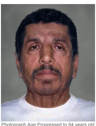
Photograph Age Progressed to 64 years old