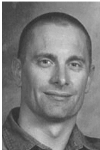
Photograph taken in 1999

Unlawful Flight to Avoid Prosecution - First Degree Murder (3 Counts), Arson of an Occupied Structure