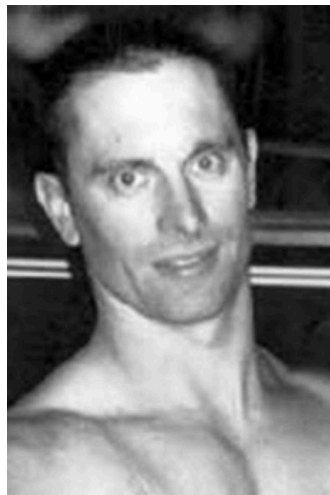
Photograph taken in 1997