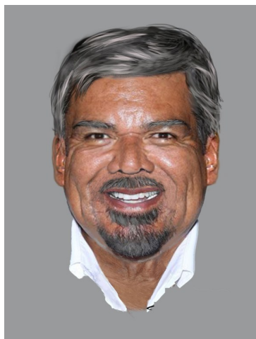
Image age progressed to 64 years old