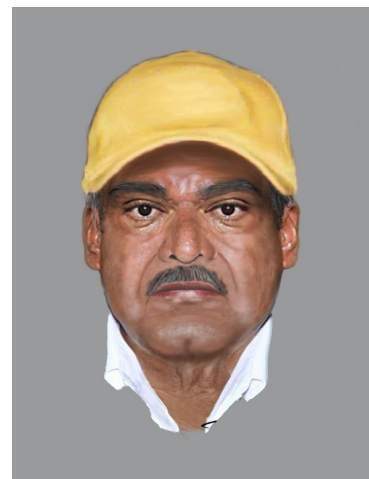
Image age progressed to 64 years old