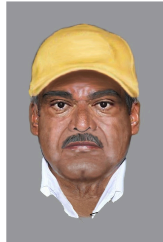
Image age progressed to 64 years old