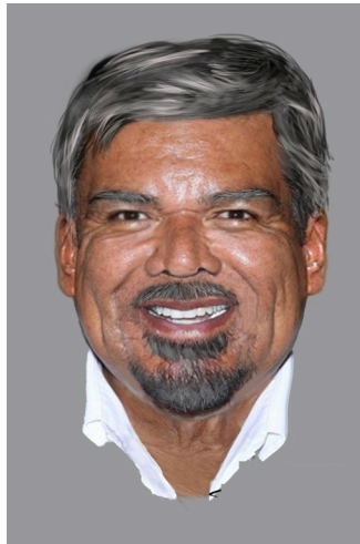
Image age progressed to 64 years old