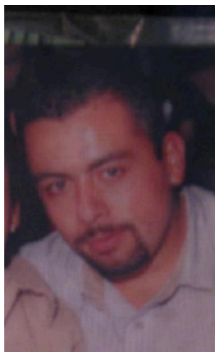
Photograph taken in 2006

Unlawful Flight to Avoid Prosecution - Murder