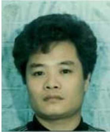
Photograph taken in 1989

Unlawful Flight to Avoid Prosecution - Murder (Five Counts), Armed Assault with Intent to Murder (One Count), Conspiracy (One Count), Carrying a Firearm Without a License (One Count)