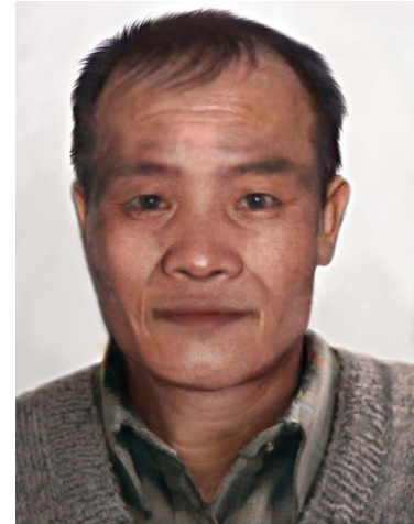
Photograph Age Progressed to Age 60