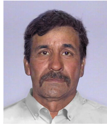
Photograph age progressed to 55 years old