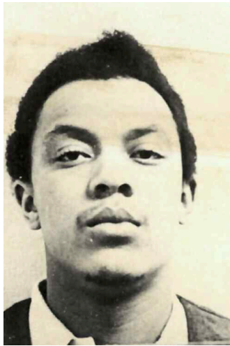
Photograph taken in 1971