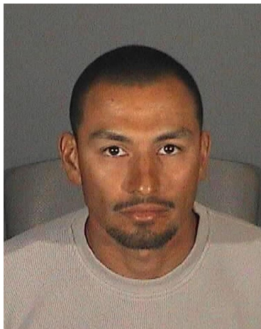
Photograph taken in 2006