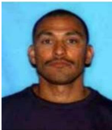
Photograph taken in 2004

Unlawful Flight to Avoid Prosecution - Murder; Attempted Murder; Assault with a Deadly Weapon