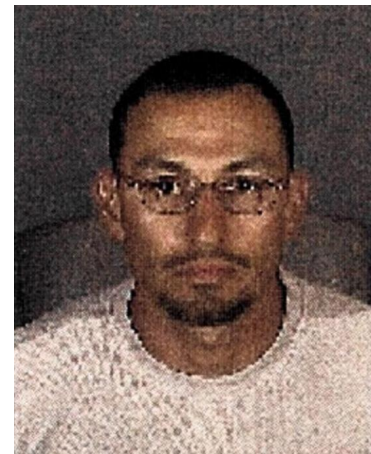
Photograph taken in 2006