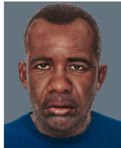
Photograph age progressed to 50 years old