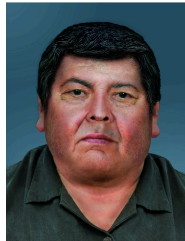
Age Progressed Photograph