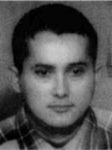
Photograph taken in 2005

Unlawful Flight to Avoid Prosecution - Murder, Kidnapping, Unlawful Restraint, Indecent Assault, False Imprisonment, Interference with a Child