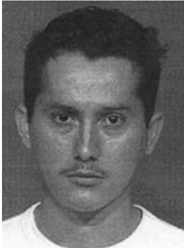
Photograph taken in 2002