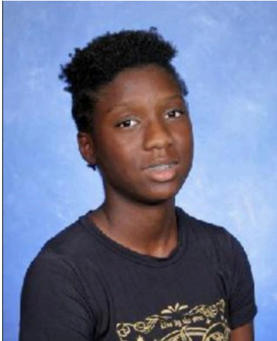
Photograph taken in 2022