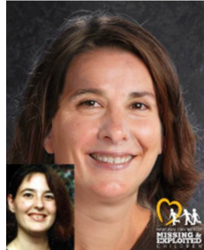
Photograph age-progressed to 45 years old