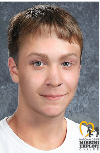
Age-progressed to 14 years