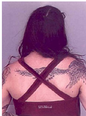
Tattoo of bird on back