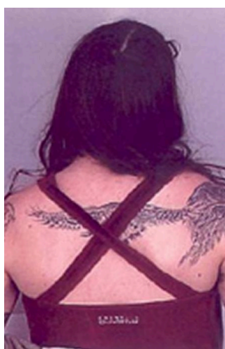
Tattoo of bird on back