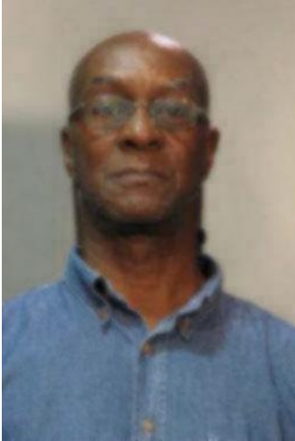
Photograph taken in 2011

Unlawful Flight to Avoid Confinement - Escape (Murder); Air Piracy (Seizing by Force an Aircraft in Air Commerce); Aiding and Abetting