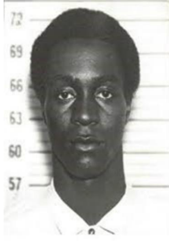
Photograph taken in 1962