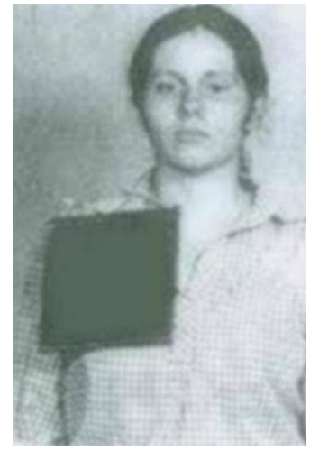
Photograph taken in 1981