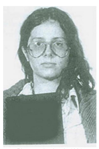
Photograph taken in 1981