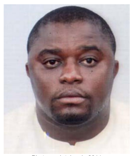
Photograph taken in 2014

Conspiracy to Commit Wire Fraud; Identity Theft; Access Device Fraud