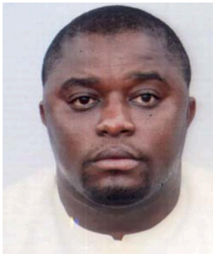
Photograph taken in 2014

Conspiracy to Commit Wire Fraud; Identity Theft; Access Device Fraud